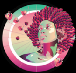
Oakland Avenue Urban Farm